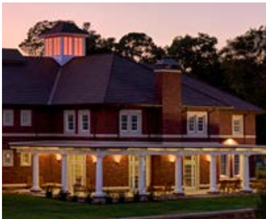
Newer facilities, like the LEED Certified Dawkins Welcome Center (shown), the LEED Gold Student Life and Technology Center, and the Miller Creative Quad, stand alongside historic buildings that carry the legacy of Hendrix while serving present needs.

Hendrix gradually increased student enrollment until it stabilized at just under 1,000 in the 1970s. In the later decades of the 20th century, Hendrix added more than 15 buildings, developed a new master plan for growth of the campus, and revised and enhanced its curriculum and added faculty in key areas. One such initiative, The Hendrix-Murphy Foundation Programs in Literature and Language, was created in 1978 to enrich the study and